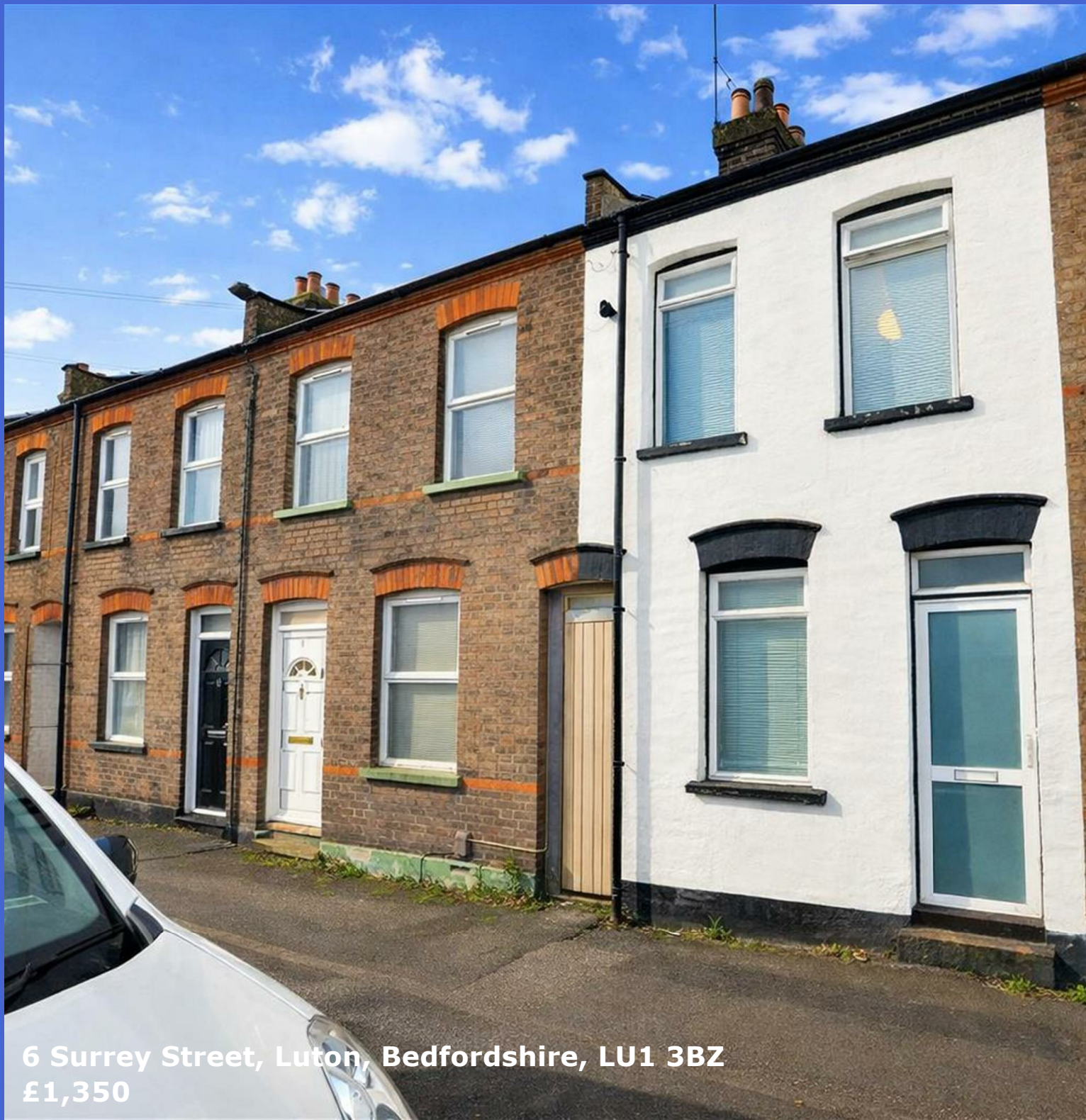
6 Surrey Street, Luton, Bedfordshire, LU1 3BZ £1,350