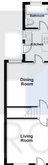
Ground Floor Approx. 31.8 sq. metres (341.9 sq. feet)